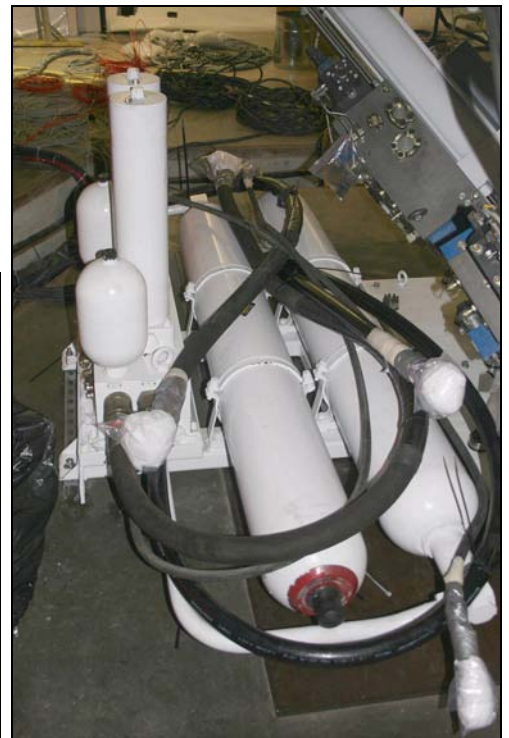
Preparing for a Simulator Move