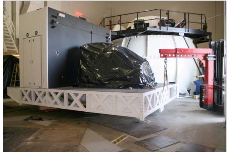
Transferring a Simulator